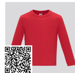
BABY L/S CA7203