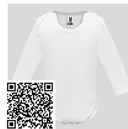
HONEY L/S BD7202