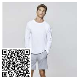
MONTECARLO L/S CA0415